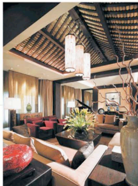
PENINSULA PALACE Beijing Suite (opposite) marries traditional Chinese architecture and modern luxury.

The more exclusive accommodations of the Grand Club occupy the 15th through 18th floors of the hotel. Insider tip: The best rooms to book on each of these floors are the 08, 09 and 10 rooms that overlook the Forbidden City and face