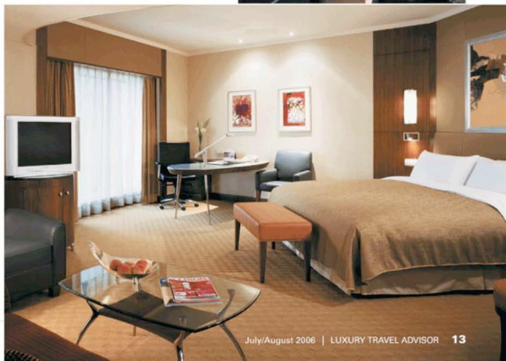
CHINA WORLD (below) makes sure guests are comfortable from the moment they land.